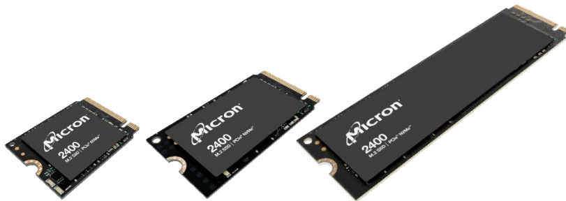
Micron 2400 SSD 22x30mm

Available in three compact M.2 form factors with capacities up to 2TB, the Micron 2400 SSD delivers improved storage density, affordability, and flexibility 2 without compromising the user experience.