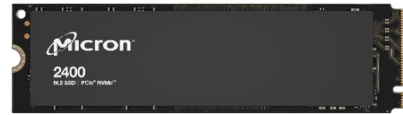
M.2 22x80mm 512GB, 1TB, 2TB