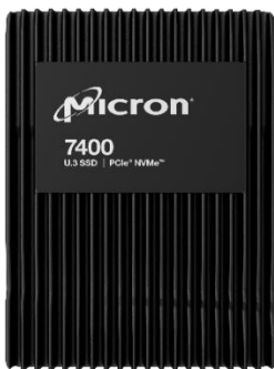
U.3: 7mm and 15mm

It is a flexible line of data center SSDs supporting standard server storage (U.3), cloud and 1U platforms (performance and density focused), and system boot (M.2).