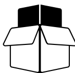
Large Object / Small Block Stores